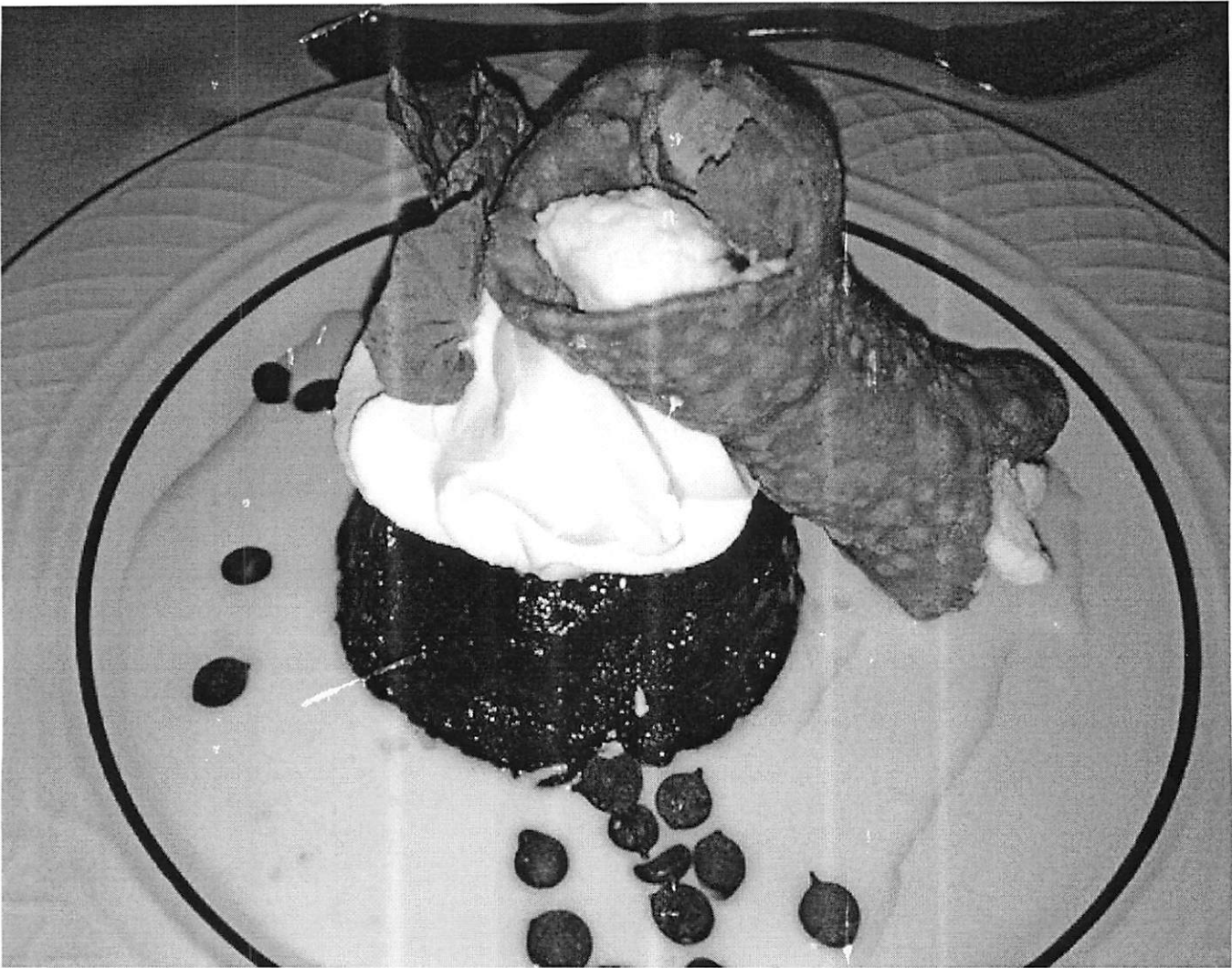
Dessert at Glenlaurel

Mankato, Minnesota. From there, he went on to attend culinary school, perfecting his skills in New York. The venue offers an upscale dining experience in a rustic 1840s log cabin setting. Diners can watch locally-sourced, seasonal ingredients being prepared in an open-kitchen, as well as take part in wine and organic beer pairings. Some of their signature dishes include an 8 oz Bone-In Pork Chop made with herbs and pomegranate reduction and paired with a Meritage from Hahn Estates on the Central Coast, Butternut Squash Ravioli simmered in a peppered Parmesan cream sauce and paired with a local Viognier-Rouseanne from Ripley, Ohio, and a Pan Roasted Chicken Breast made with locally-sourced apples and onions served with a Chilean Pinot Noir.