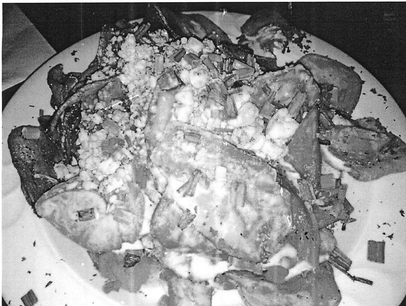
House-made Potato Chips with a Creamy Bleu Cheese Sauce and Crumbles from Brass Ring Restaurant