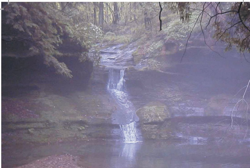
Camusfearna Gorge at Glenlaurel