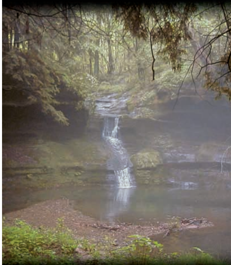
Camusfearna Gorge at Glenlaurel