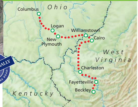
For full maps of Ohio and West Virginia, see pp. 78-81 and 112 of the Rand McNally 2006 Road Atlas.

En route east towards West Virginia, Etta's Lunchbox serves up more than pizza and sandwiches. The walls and ceiling of this café and general store are covered with owner Ledora Ousley's collection of lunchboxes dating from the 1940s. Find your favorite lunchbox from your schooldays and Ousley usually makes a spot-on guess of your age. "First I had 20, then 50. Now I have 650," Ousley says, though not all are on display.