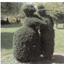
Topiary couple in Columbus, Ohio, represents Seurat's La Grande Jatte .

To the east of downtown, on the corner of East Town and Washington, the Topiary Garden at Old Deaf School Park recreates in topiary Georges Seurat's painting A Sunday on La Grande Jatte . There are 50 living sculptures of people, boats, and animals — some 12 feet high — in the nine-acre park.