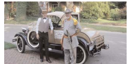
Homeowners in period dress pose in Parkersburg, WV.

Across the Ohio River, Parkersburg, West Virginia, wears its age well. At the Visitors Center, detailed brochures are available for a tour of the Julia-Ann Square Historic District. Though the 26-home tour is designated as walk-by, the proud homeowners sometimes invite curious passersby in for a peek into the renovations.