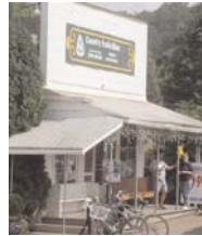
Riders can rent bikes in Cairo, WV for a rail trail trip through old train tunnels.

Half an hour east of Parkersburg in Cairo, just off US 50, the 72-mile North Bend Rail Trail includes thirteen tunnels for bikers to pass through, including one purported to be haunted. Country Trails Bikes , just off