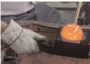
A craftsman molds hot glass at Fenton Art Glass in Williamstown, WV.

Upriver in Williamstown, Fenton Art Glass remains one of the last of a long line of glass operations in West Virginia. It is still owned by the Fenton family, which founded it in 1905. Up to eight factory tours a day and an