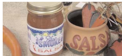
A variety of salsas and gifts are sold at Blue Smoke Salsa in Ansted, WV.

In the town of Ansted, Robin Hildebrand, president of Blue Smoke Salsa, proudly shows customers her selection of tasty, award-winning salsas, made on site. The production line is visible through a window inside the store. The company makes 600-1,200 jars per day, using peppers grown in the state. At $5 a jar for flavors ranging from mild to extra hot, the salsa makes an unusual souvenir.