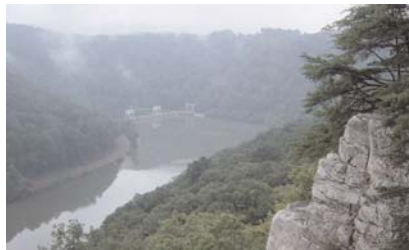
Lover's Leap lookout is a favorite vista at Hawks Nest State Park, in West Virginia.

Interstate 77 heads straight through Charleston and into Beckley and the New River Gorge area. But a more scenic route jogs east on US 60 along the Midland Trail. A platform at Hawks Nest State Park, in Ansted, overlooks the New River. Here, an aerial tram brings park guests to New River Jetboat Tours, a 30-minute wet and wild ride upstream to the New River Gorge Bridge towering 876 feet above.