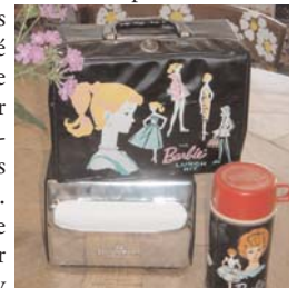
Barbie is just part of the extensive collection at Etta's Lunchbox Café, New Plymouth, Ohio.

En route east towards West Virginia, Etta's Lunchbox serves up more than pizza and sandwiches. The walls and ceiling of this café and general store are covered with owner Ledora Ousley's collection of lunchboxes dating from the 1940s. Find your favorite lunchbox from your schooldays and Ousley usually makes a spot-on guess of your age. "First I had 20, then 50. Now I have 650," Ousley says, though not all are on display.