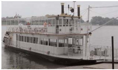
A ferry shuttles visitors to Blennerhasset Island State Park in West Virginia.

Near the Oil and Gas Museum, the Blennerhasset Museum of Regional History sells tickets to Blennerhasset Island State Park. The island, purchased in 1798 by wealthy Irish immigrants Harmon and Margaret Blennerhasset, can be accessed via a paddlewheel boat in summer.