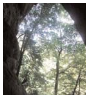
A rock formation frames the forest at Hocking Hills State Park, Ohio.

South of Columbus, the drive quickly passes into farmland and wooded areas. In the Hocking Hills, lodging options range from simple campsites and motels to cabins at upscale resorts like Glenlaurel Inn and Inn at Cedar Falls. Dinner at the Scottish-style Glenlaurel Inn is a five-course affair for $49 plus tax and tip. Entrees vary, but may include filet mignon, salmon, or rack of lamb, served in the castle-motif dining room.